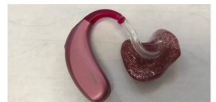
6) Attach the trimmed earmold to the hearing aid