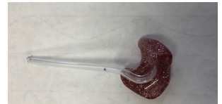
1) Put the new earmold with the long tubing into your child's ear