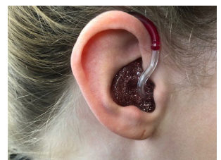
7) Put the hearing aid on your child's ear